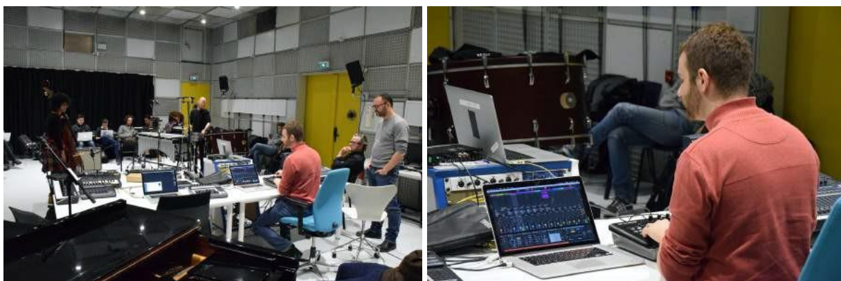
In the studios with Ircam’s teaching teams

A genuine springboard for the careers of young composers, the Élan Award is designed to promote their outreach and provide them with professional support over several years.